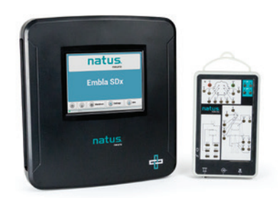
Standard sleep testing with Embla SDx