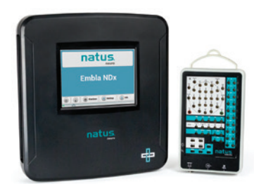
Advanced neuro-sleep monitoring with Embla NDx